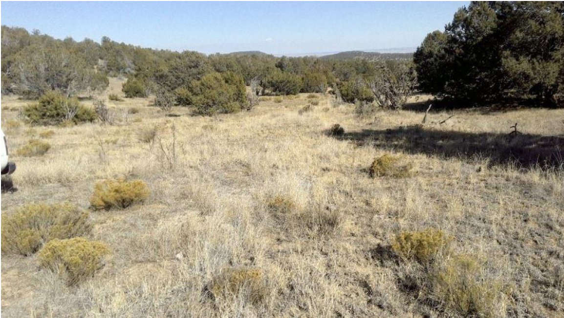
Photo 3. Example of vegetation density and terrain.