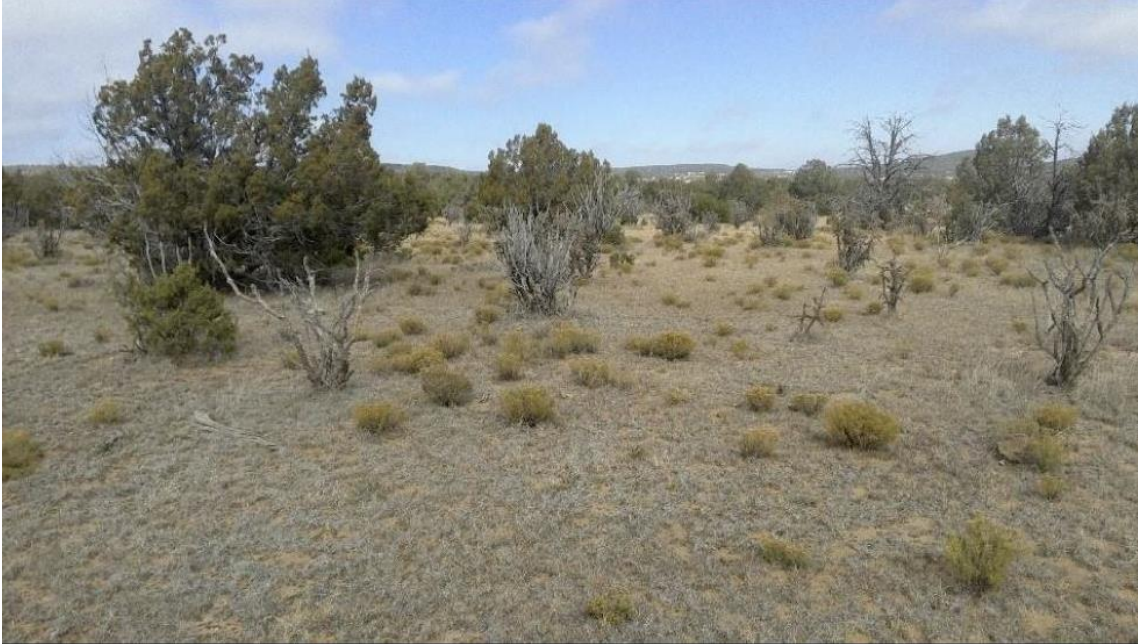
Photo 1. Example of vegetation density and terrain.