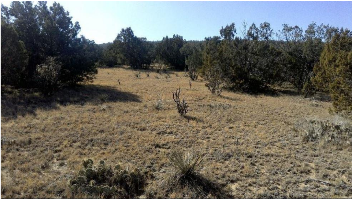
Photo 2. Example of vegetation density and terrain.