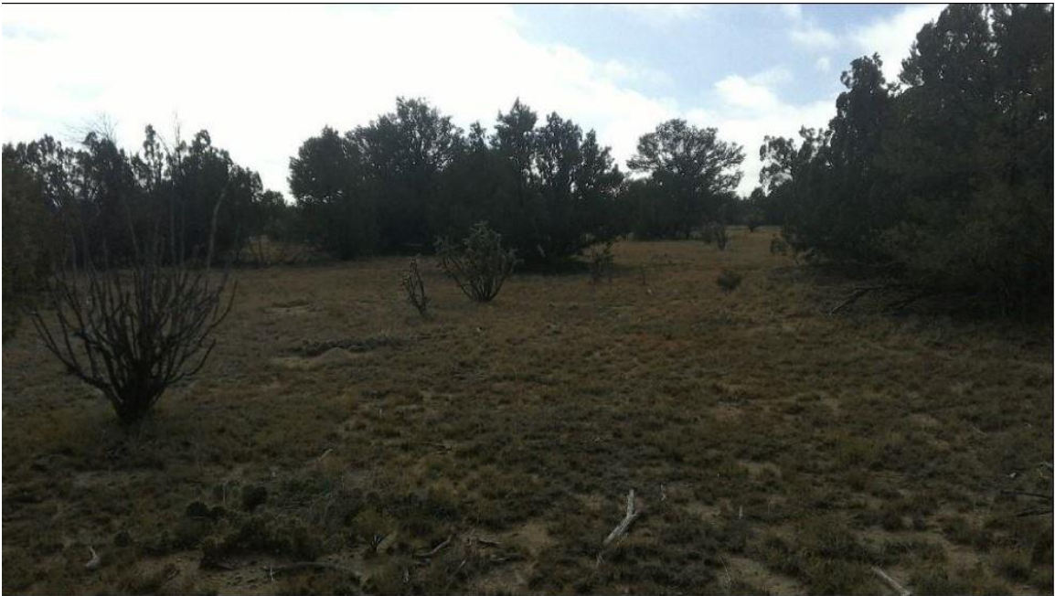
Photo 4. Example of vegetation density and terrain.